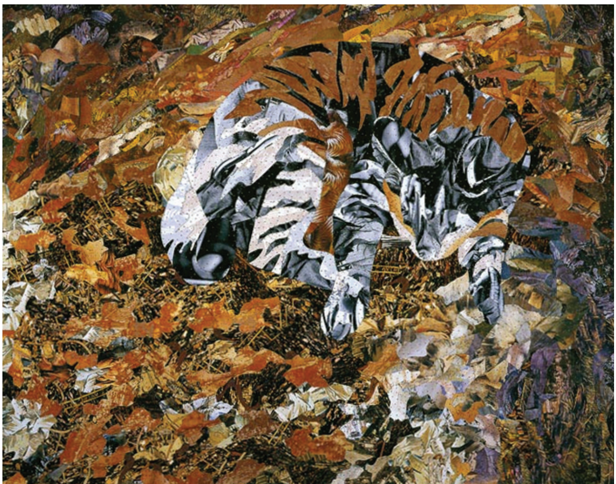
Savannah , 2003, Found and fabricated printed tin collaged on plywood with steel brads, 48" x 60"