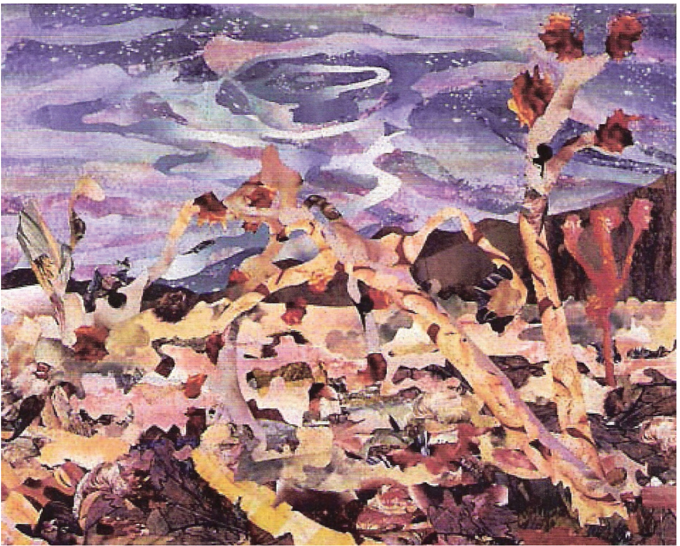
ABOVE: Joshua Trees , 2001, Found and fabricated printed tin collaged on plywood with steel brads, 34" x 66" ON FRONT COVER: Echo , 2005, Found and fabricated printed tin collaged on plywood with steel brads, 36" x 34"