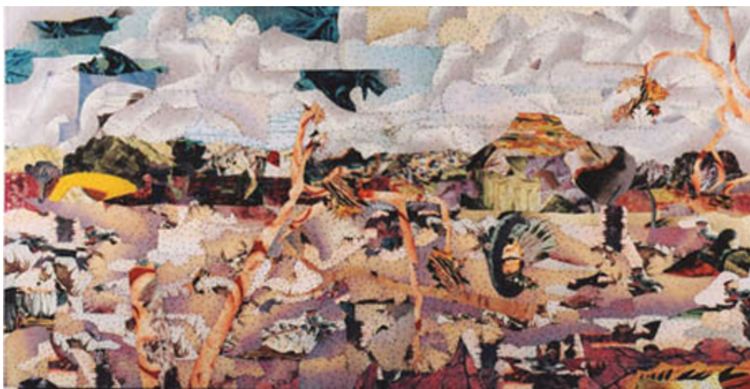
Out of L.A., 2005, Found and fabricated printed tin collaged on plywood with steel brads, 34" x 66"